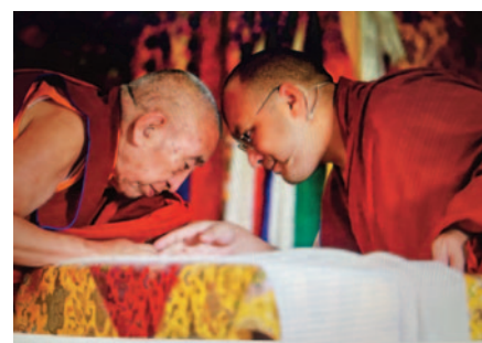
Thrangu Rinpoche and HH Karmapa

of the text Gateway to Knowledge, by Mipham Rinpoche. In this video we learned that Mipham Rinpoche had a very close connection with the Traleg lineage. Mipham Rinpoche had composed the text up on the hill above Thrangu Monastery. Mipham Rinpoche even taught the text to Situ Pema Wangchuk Gyalop (the 11th Tai Situ Rinpoche), where this lineage transmission is unbroken till now.