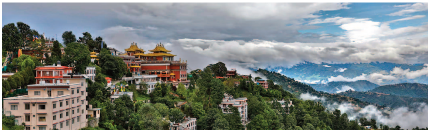
Namo Buddha Nepal

“On the 4th of June 2023, the full moon day of the fourth Tibetan month, Saga Dawa – the day we celebrate the Lord Buddha Shaka-muni’s birth, enlightenment and parinirvana, The Very Venerable Khenchen Thrangu Rinpoche decided to leave this world of space and time. Rinpoche laid onto his right side, adopting the same posture as Buddha Shakyamuni did, and remained in Tukdam for three days as he passed into parinirvana.”